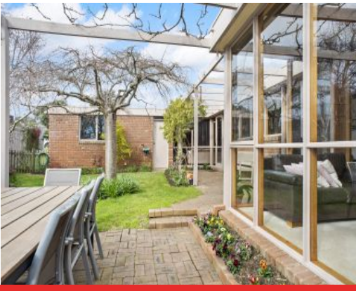
4 Foam Street OCEAN GROVE, VIC