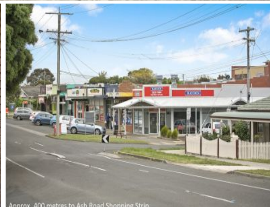
Approx. 400 metres to Ash Road Shopping Strip