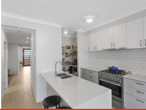
36 Grove Road MARSHALL, VIC