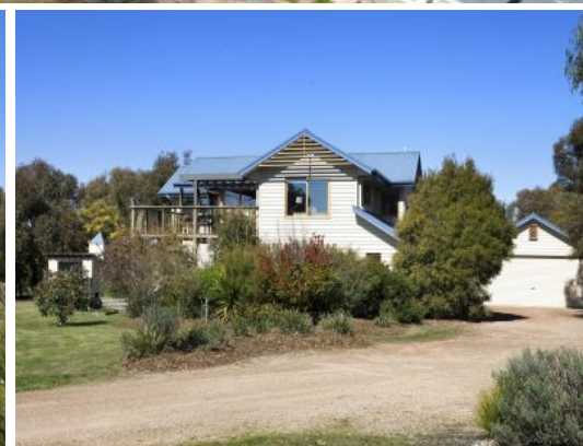
2 Port Phillip Court TORQUAY, VIC