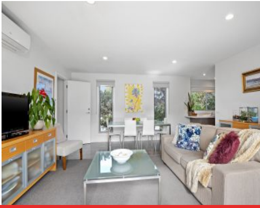
69-71 Tareeda Way OCEAN GROVE, VIC