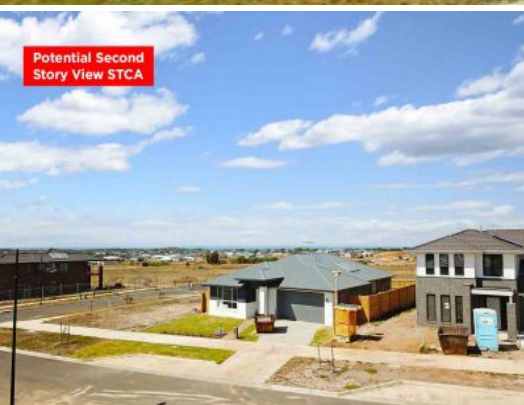
Potential Second Story View STCA