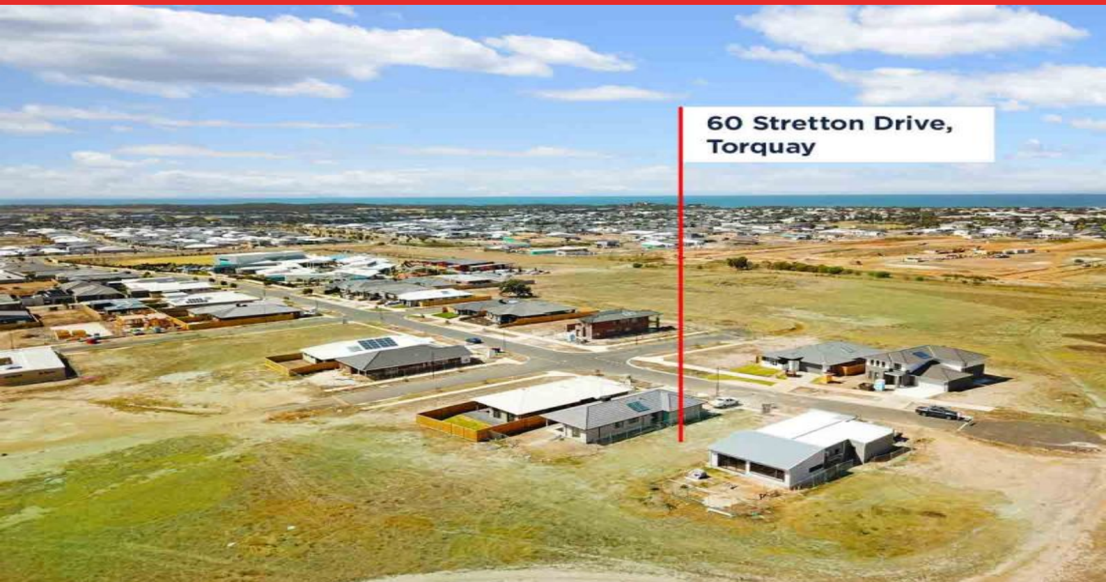
60 Stretton Drive, Torquay