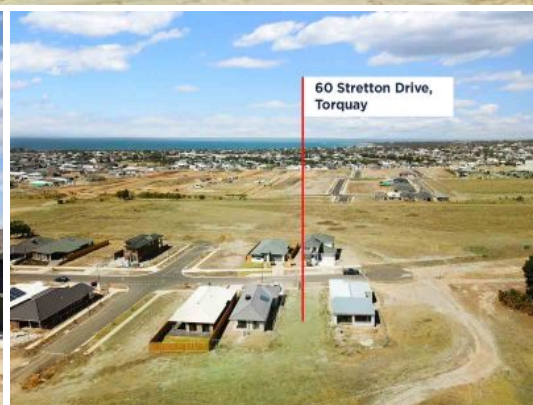
60 Stretton Drive, Torquay