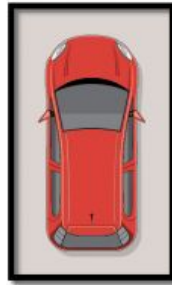
CARSPACE (NOT IN POSITION)