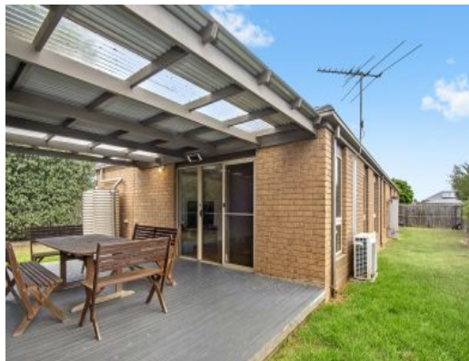
14 Warrumbungle Close OCEAN GROVE, VIC