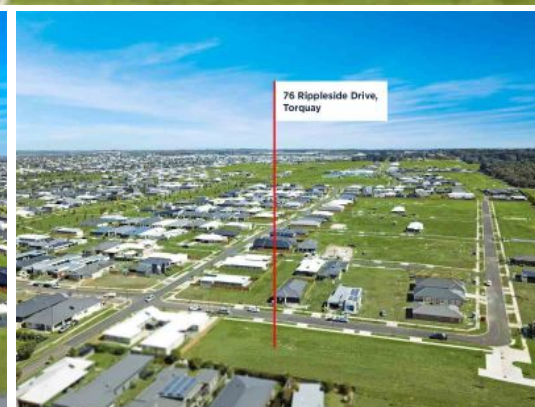
76 Rippleside Drive, Torquay