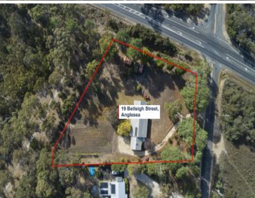
19 Betleigh Street, Anglesea