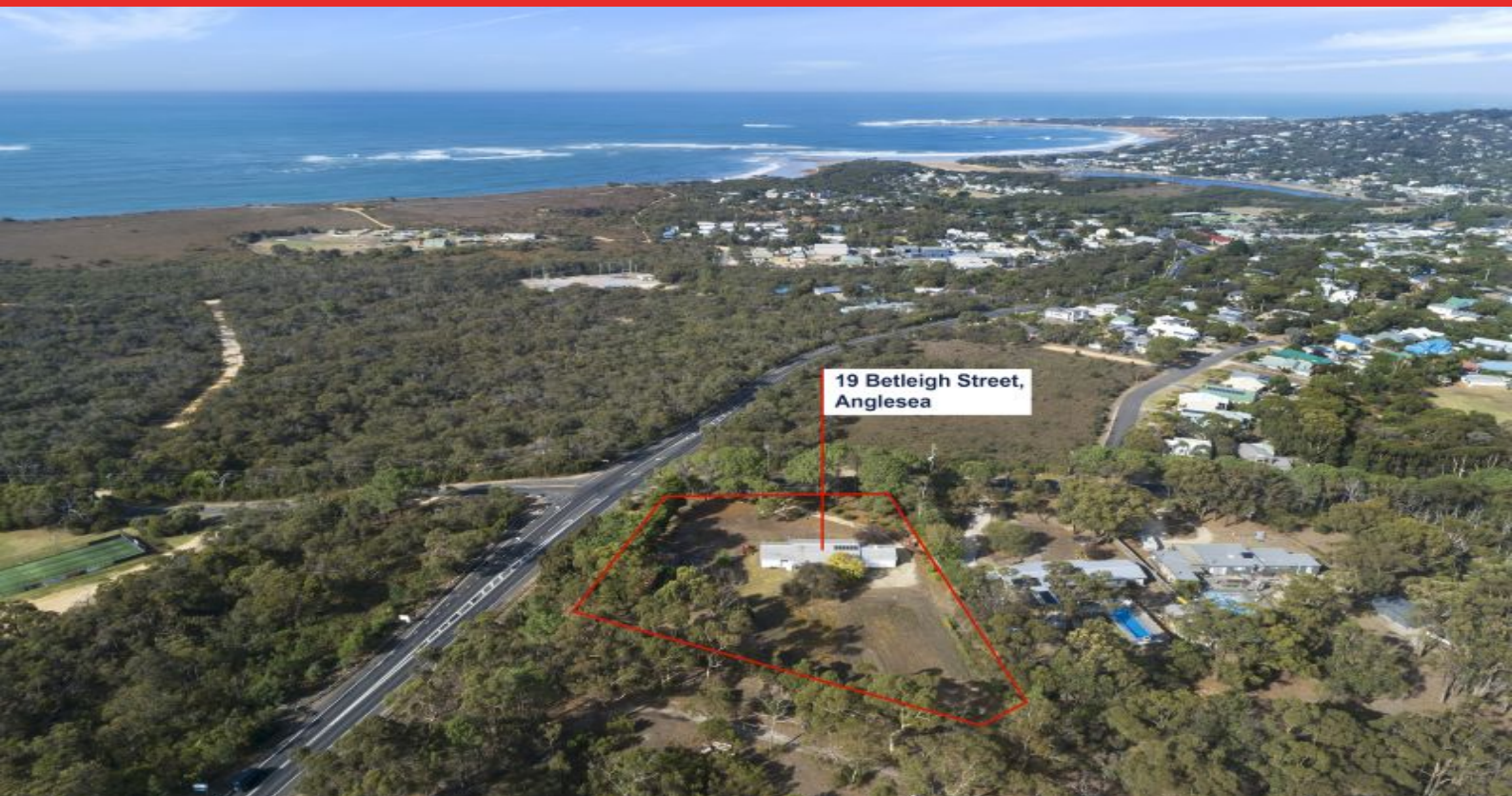
19 Betleigh Street, Anglesea