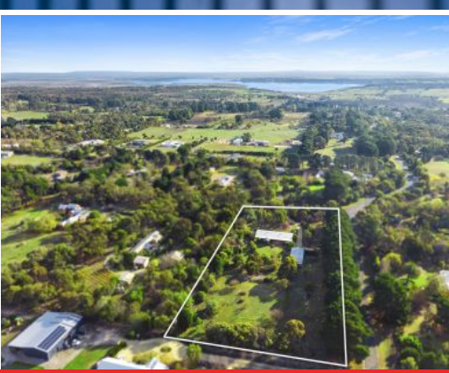
1-9 Grigg Court WALLINGTON, VIC