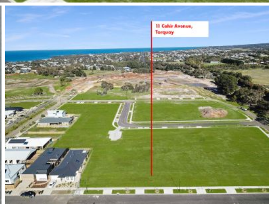
11 Cahir Avenue, Torquay