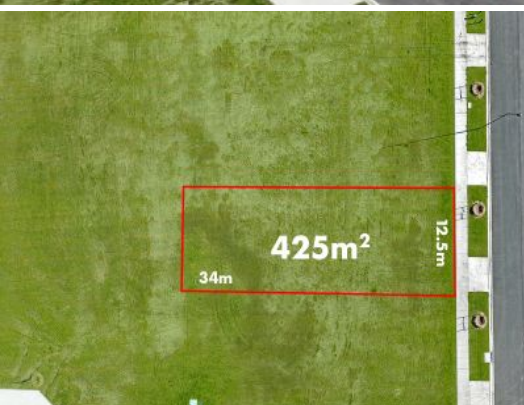
425m 2 34m 12.5m