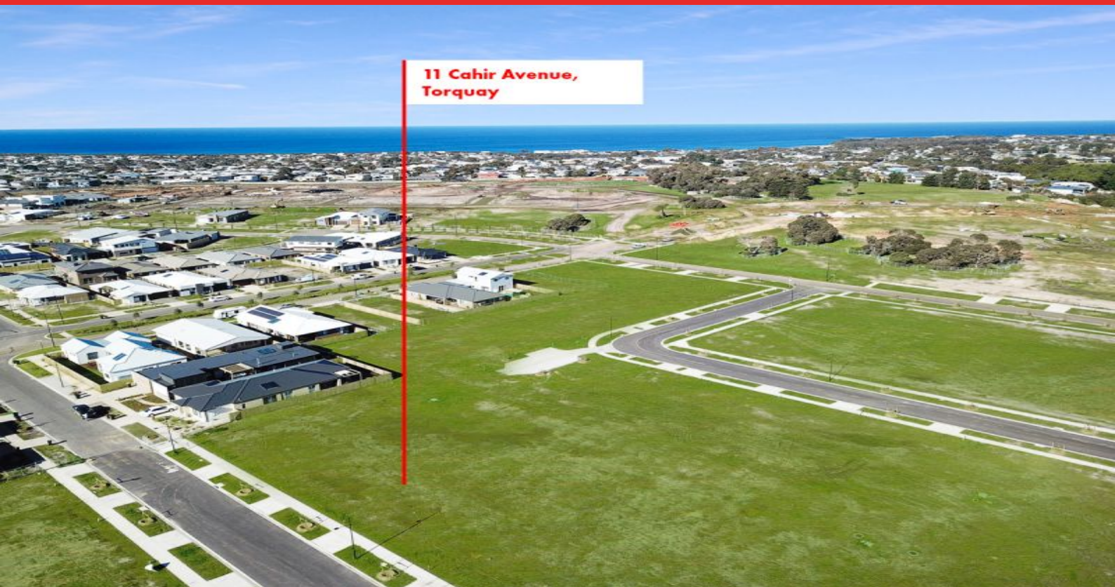
11 Cahir Avenue, Torquay