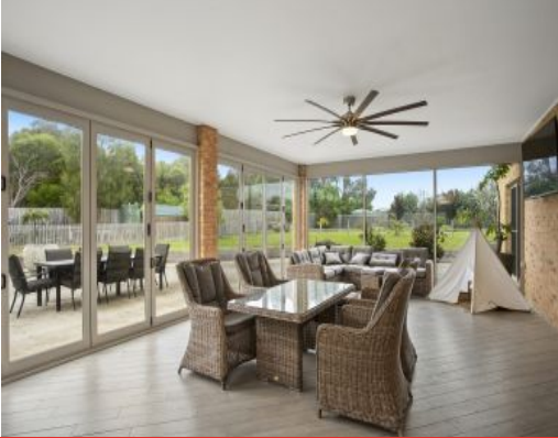
10-11 Rickman Court LEOPOLD, VIC