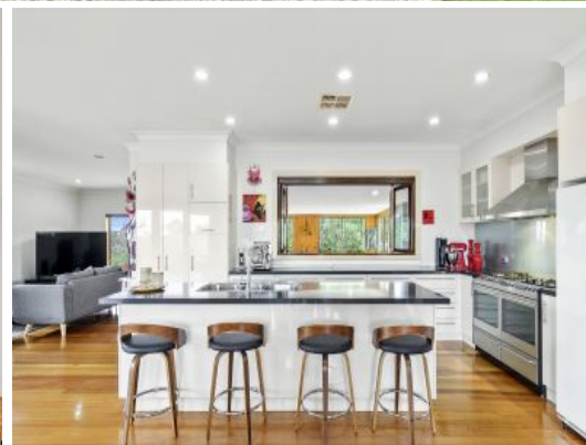
7-8 Vancouver Close LEOPOLD, VIC