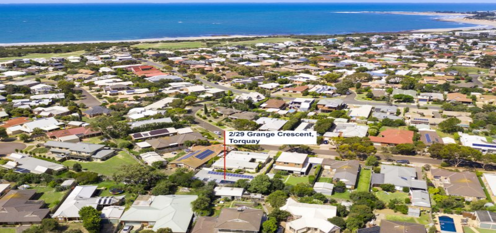
2/29 Grange Crescent, Torquay