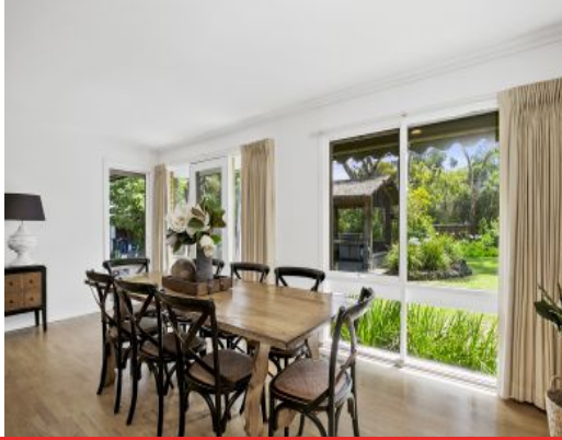
236-238 Thacker Street OCEAN GROVE, VIC