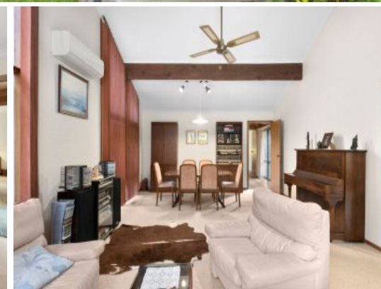
2 Sandpiper Court OCEAN GROVE, VIC