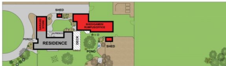
SITTING AREA SITE PLAN

Approx House Area 248m 2 Approx Land Area 5736m 2