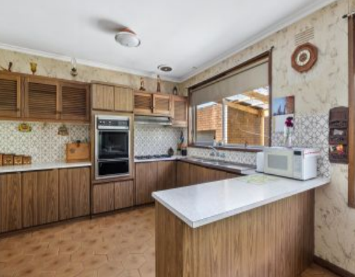
22-24 Manton Road MOOLAP, VIC