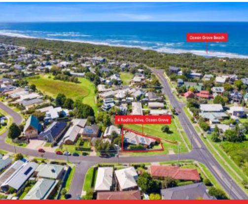
4 Roditis Drive OCEAN GROVE, VIC