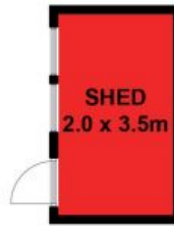
(NOT IN POSITION)