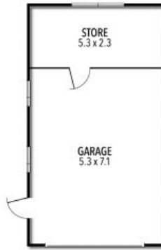
(NOT IN POSITION)