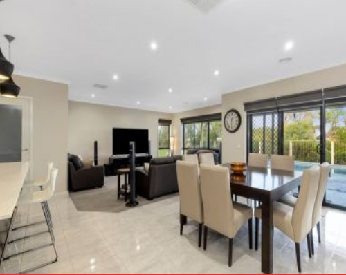
57-61 Goandra Drive OCEAN GROVE, VIC