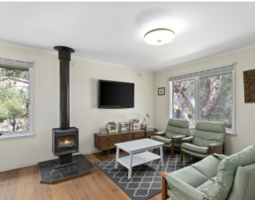
9 Hedley Street ANGLESEA, VIC