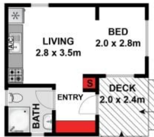
BUNGALOW (NOT IN POSITION)

Whilst bwr.com.au has made every attempt to ensure the accuracy of the floor plan contained here, measurements are approximate and no responsibility is taken for any error, omission, or mis-statement. This plan is for illustrative purposes only.