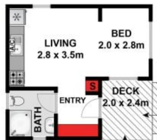
BUNGALOW (NOT IN POSITION)

Whilst bwrm.com.au has made every attempt to ensure the accuracy of the floor plan contained here, measurements are approximate and no responsibility is taken for any error, omission, or mis-statement. This plan is for illustrative purposes only.