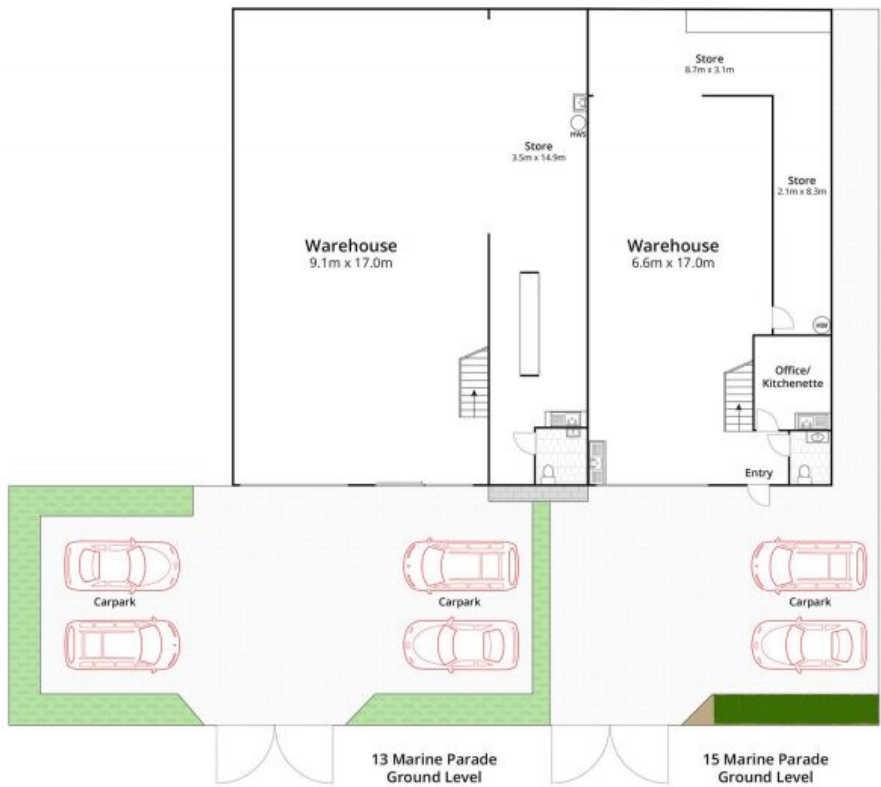
13 Marine Parade Ground Level