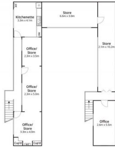
13 Marine Parade First Level