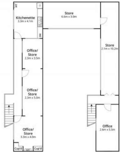
13 Marine Parade First Level