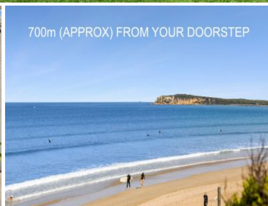
700m (APPROX) FROM YOUR DOORSTEP