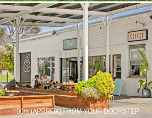
100m (APPROX) FROM YOUR DOORSTEP