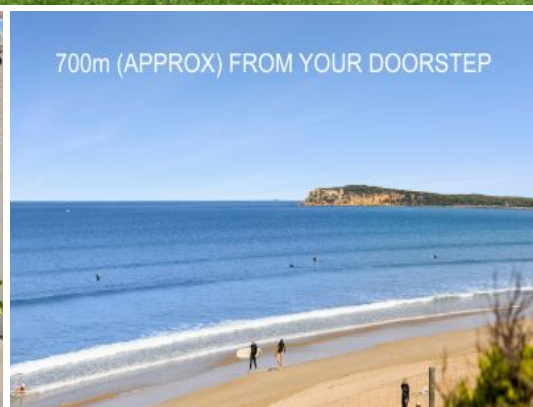
700m (APPROX) FROM YOUR DOORSTEP