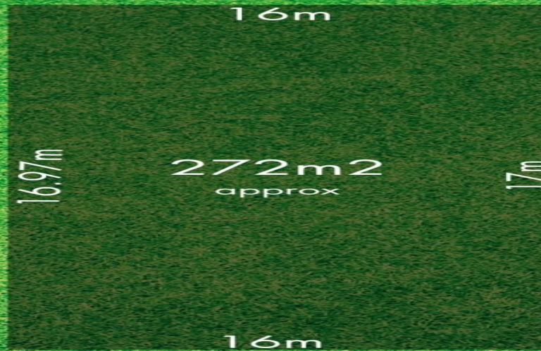
Lot 81 Cordyline Street