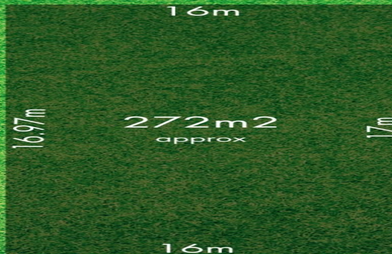
Lot 81 Cordyline Street