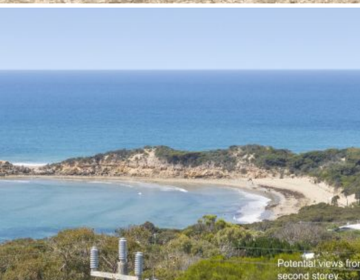
Potential views from second storey