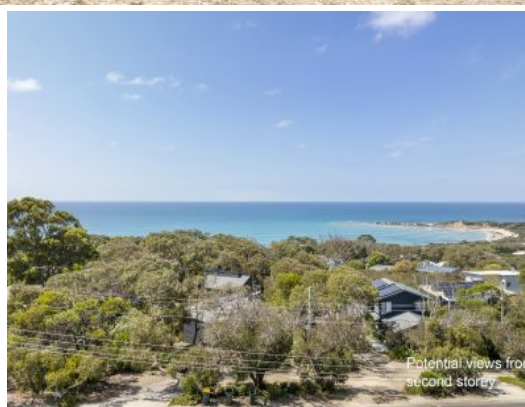
Potential views from second storey