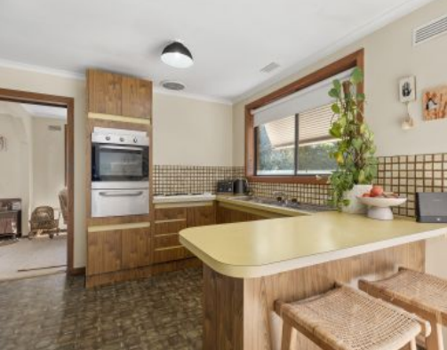
3 Caithness Court JAN JUC, VIC